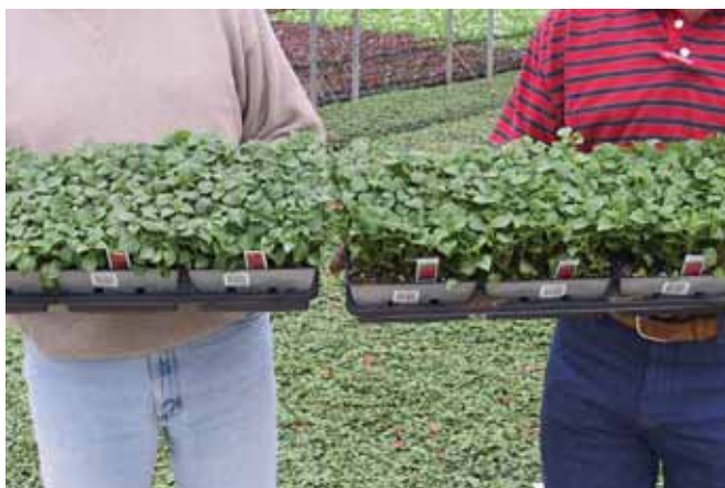
A grower trial shows impatiens grown in 20 PBH (left) and 20% perlite (right).