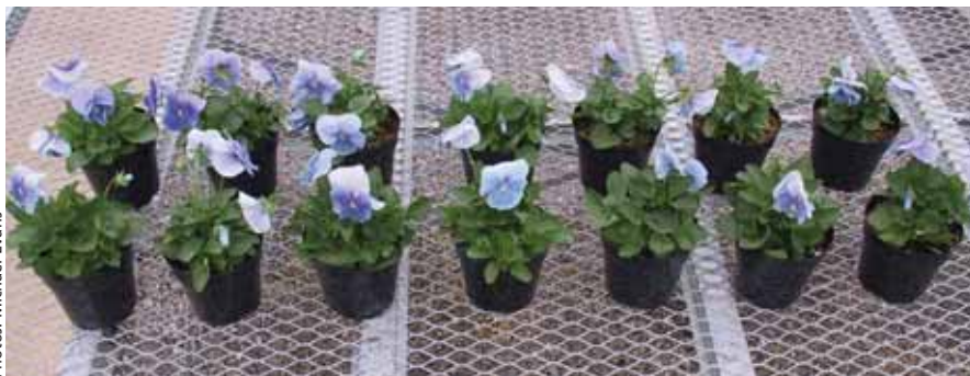
A comparison trial shows pansies grown in PBH (back row) versus perlite (front row). The percentage of perlite or PBH, from left to right, is 10%, 15%, 20%, 25%, 30%, 35% and 40%.

physical properties. True-composted rice hulls are typically used in a root substrate to provide for water-holding capacity.