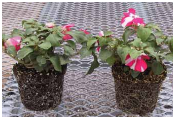
A side-by-side comparison of impatiens grown in 20% perlite (left) and 20% PBH (right).

Of course growing conditions vary from greenhouse to greenhouse. Therefore, the best course of action for is to conduct on-site trials in your greenhouse with varying rates to determine