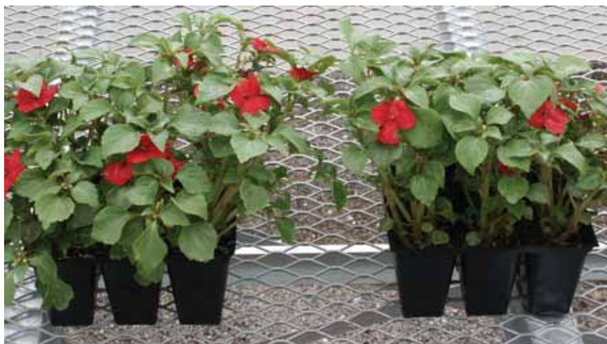
Impatiens grown in a substrate of 30% perlite (left) and 30% rice hulls (right).

In growth trials at the University of Arkansas, vinca, geranium, impatiens, marigold and pansy plants grown in PBH-containing substrates were similar to those grown in equivalent perlite-containing root substrates. Although plants were grown in substrates containing 10% to 40% PBH or perlite, the highest shoot and root growth occurred for plants grown in root substrates containing 20% to 30% PBH. Similar results have been found in grower-based plant growth trials using sphagnum peat-based root substrates with 20% to 30% PBH or perlite. Most anecdotal reports from growers have indicated best results from PBH when it constituted 20% to 25% of the total volume of the substrate.