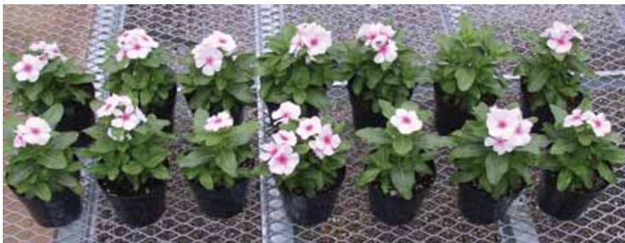
Vinca grown in root substrates of perlite (front row) and PBH (back row). The percentage of perlite or PBH, from left to right, is 10%, 15%, 20%, 25%, 30%, 35% and 40%.

Therefore, peat-based substrates containing 20% or less PBH have similar properties to equivalent peat-based root substrates containing equivalent amounts of perlite. However, root substrates containing more than 20% PBH will generally have a higher level of drainage and air-filled pore space and a lower water-holding capacity than peat-